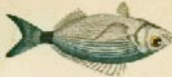
SCALED BRIM - Chromis leucostictus