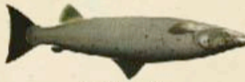
SALMON - Salmo salar