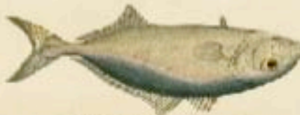
YELLOW TAIL - Merluccius merluccius