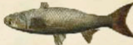
GREY MULLET - Lutjanus fulviflamma