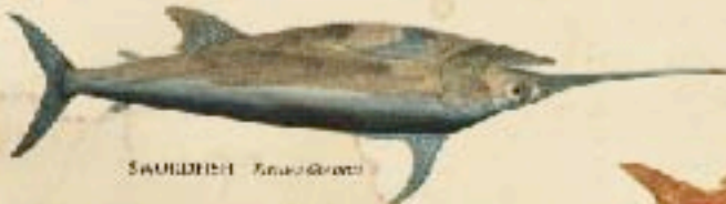
SWORDFISH - Xiphus