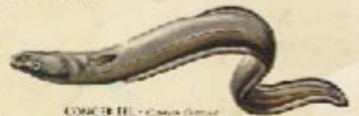
CONGER EEL - Conger conger