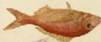
TANGKULA - Urophycis regia