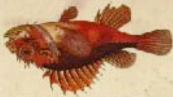
SCORPIUS FISH - Scorpaenidae