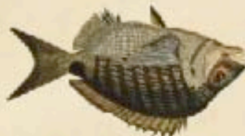
WHITE BRIM - Chromis leucostictus