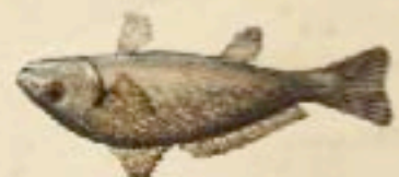
TOMATE - Lutjanus fulviflamma