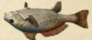
BELAMY MULLET - Lutjanus fulviflamma