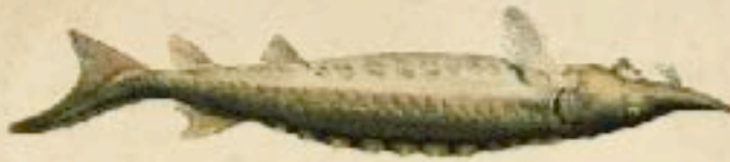
COMMON STURGEON - Acipenseridae