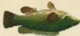
TALLOW WRASSE - Urophycis regia