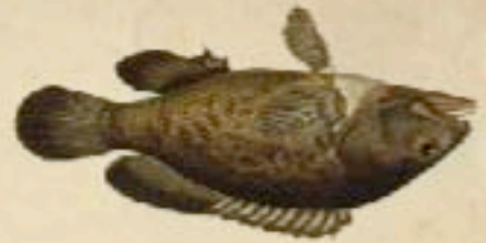
GREATER OR DUSKY PERCH - Micropterus dolomieu