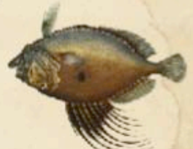
GREEN EYE - Merluccius merluccius