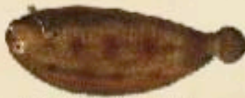
COMMON SOLE - Solea solea