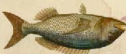
DENTEX - Urophycis regia