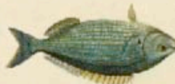
YELLOW TAIL - Merluccius merluccius