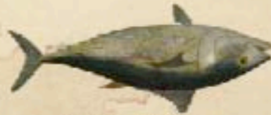
TURNSTONE - Lutjanus fulviflamma